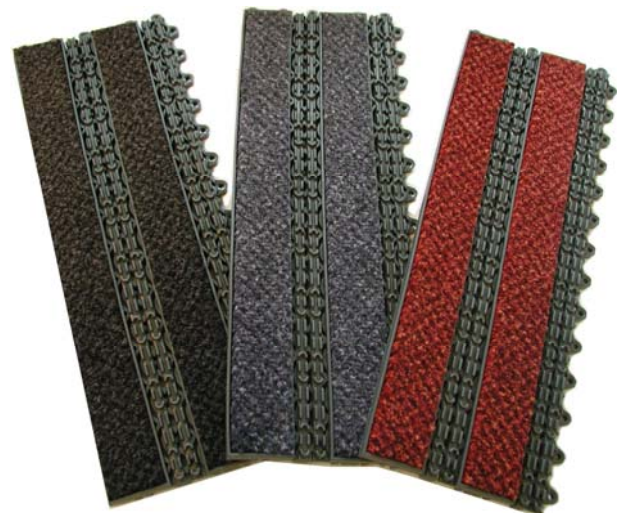
Insert colours are graphite, blue and red.